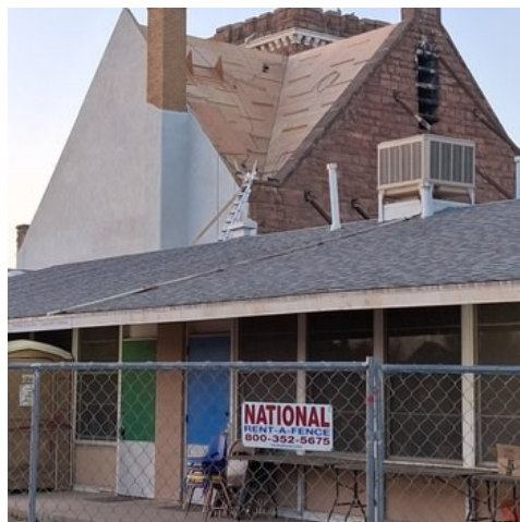
First Presbyterian Church Douglas AZ—Rebuilding