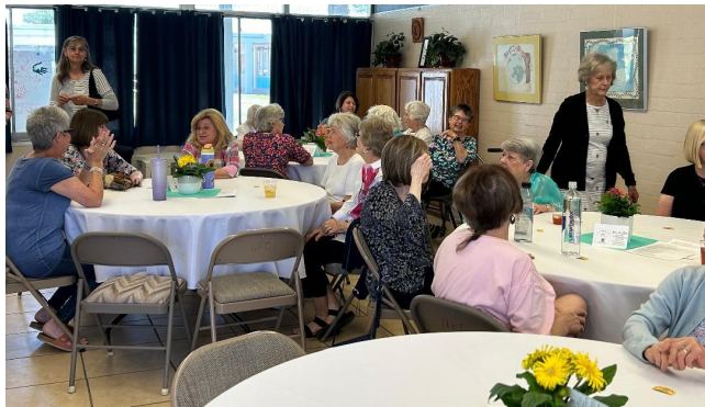
2024 PW Spring Luncheon

The Spring Luncheon will be held in Fellowship Hall on Saturday April 26 th . We will begin at 11:00 AM, lunch will be provided by the Co-ordinating Team. Our guest speaker from Woman 4 Women will share information about their organization. After that we will help put together feminine hygiene kits, and Manna Bags for the summer months. This is a great opportunity to combine FUN, FOOD, FELLOWSHIP & MISSION. Everyone is welcome!