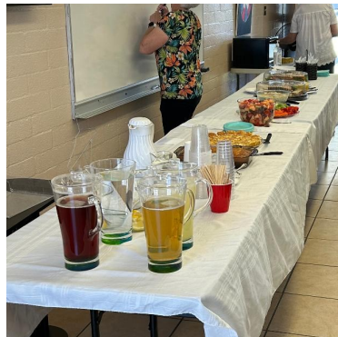
2024 PW Spring Luncheon Food